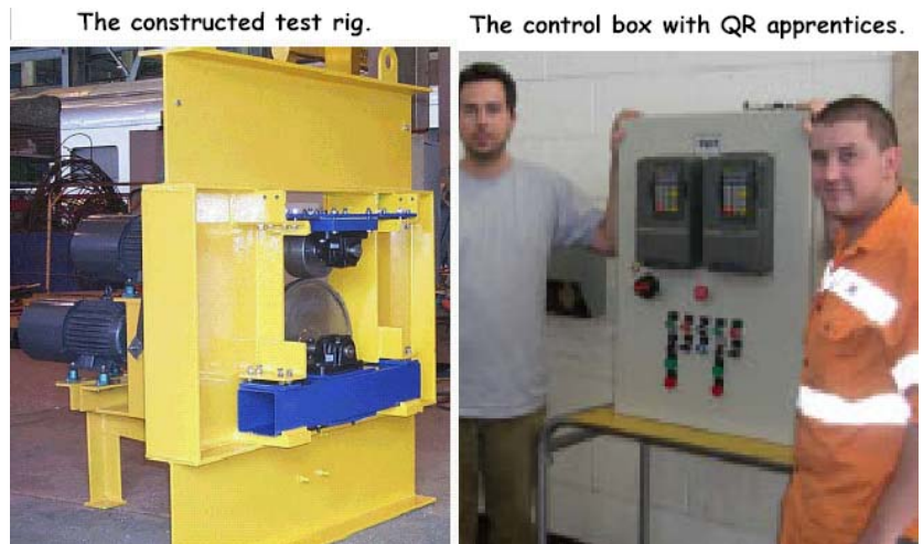
Figure 3. Corrugation testrig